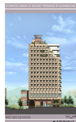
The Regency Residence, side elevation

Interested? Visit us at: www.mongolianproperties.com m/indexrr.htm