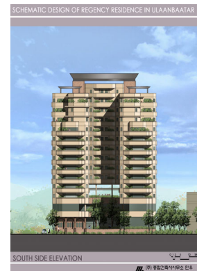
The Regency Residence front elevation

“The Regency Residence will be the number 1 luxury apartment condominium in Mongolia”