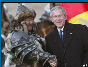
President Bush visits Mongolia in November 2005

We cover all of the necessary paperwork including the legal services.