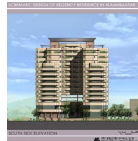
The Regency Residence front elevation

“The Regency Residence will be the number 1 luxury apartment condominium in Mongolia”