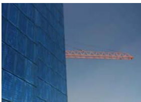
CTIC bank in Ulaanbaatar

Interested? email us at: degrubenc@apipcorp.com