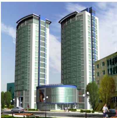
Future potential project by Mongolian Properties to build the MITIC Towers in Ulaanbaatar.