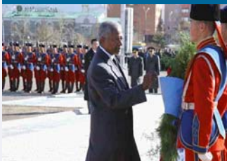
UN Secretary-General Kofi Annan inspecting the troops in Ulaanbaatar.

Should you wish to receive a presentation or the supporting documentation please email us at: degrubenc@apipcorp.com